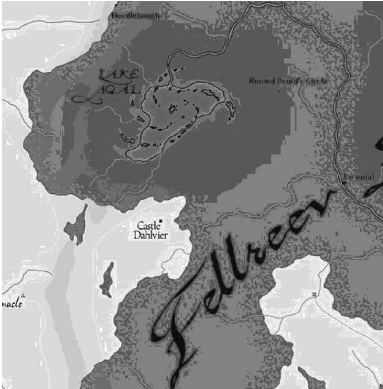
- The Artonsamay River, approaching Lake Aqal